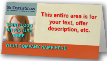
TABLE TENT CARDS

SKI • SNOWBOARD • ACTIVE SPORTS • TRAVEL EXHIBITOR MARKETING TOOLS